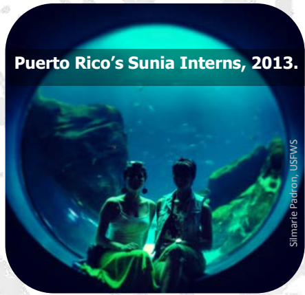
Puerto Rico's Sunia Interns, 2013.